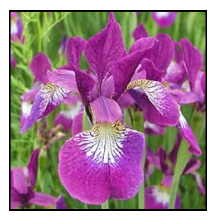
LITTLE RED (Vaughn, K.) 18", M. to L., 3" $10.00

Gorgeous, large, light purple-blue color that glows with lighter standards. Very large flaring standards. A favorite here.