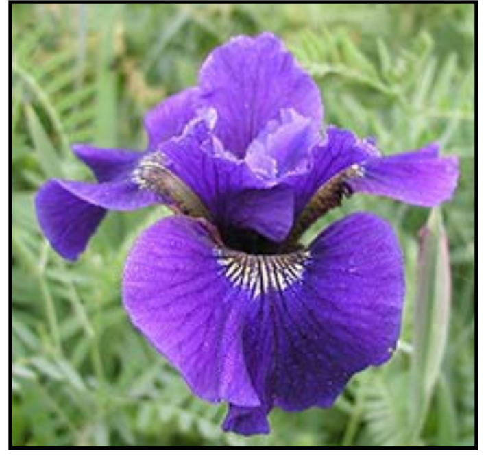
RUFFLED VELVET (McEwen, C.) 22", M. to L., 4 ½" $15.00

Dark rich blue-purple with near-black falls. Flaring standards and very wide falls. H. M. Award.