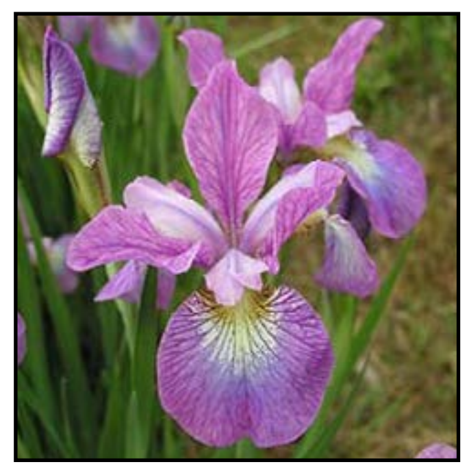
ILLINI CHARM (Varner, S.) 24", E. to L., 4" $12.00

This purple selection of Iris sanguinea has a striking flower form with pendulous falls and vertical standards.