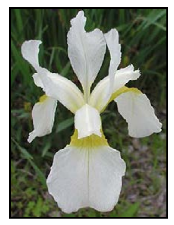
SNOWCREST (Gage, L. M.) 28", L.M., 3 ¼" $10.00

Sparkling, snow white with heavy texture and stately form. Morgan Award.