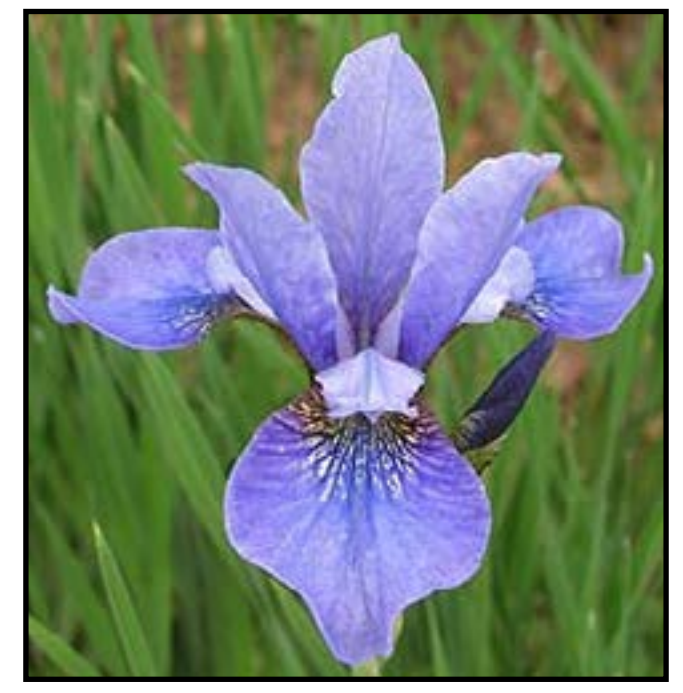
KINGFISHER BLUE (Wallace) 32", M., 4" $15.00

Large, pale violet blue with lighter standards. Very pretty.