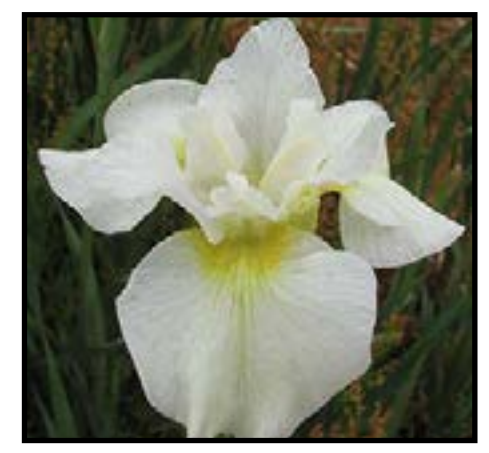
CRÉ ME CHANTILLY