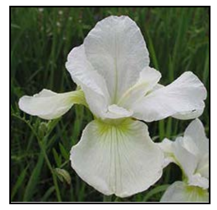
LIMEHEART (Brummitt, M.) 34", M., 4" $12.00

Unique white flower with pale green overcast. Wide petalled and especially crisp look. Top quality.