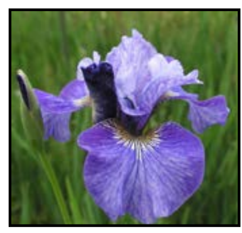
ALL IN STIPPLE