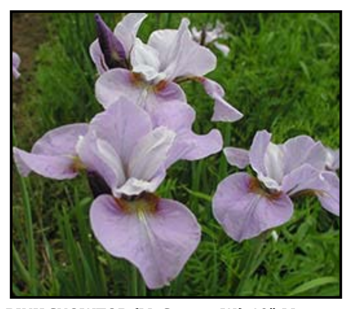
PINK SNOWTOP (McGarvey, W.) 40", M., 3 <sup>1</sup>/<sub>2</sub>" $10.00 A beautiful lavender-pink amoena, standards open light pink and fade immediately to white

A beautiful lavender-pink amoena, standards open light pink and fade immediately to white. Falls pink, opens to moderate purplish pink. Stylearms white.