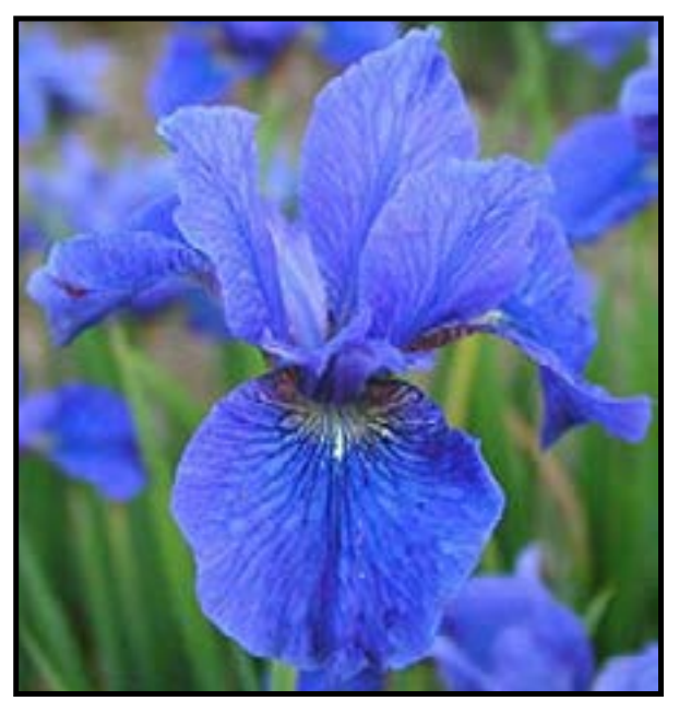
STELLAR BLUE (Warburton, B.) 30", M. $15.00

Large, deep-violet blue self with ruffles. Stylearms ruffled and elliptical. A vigorous grower.