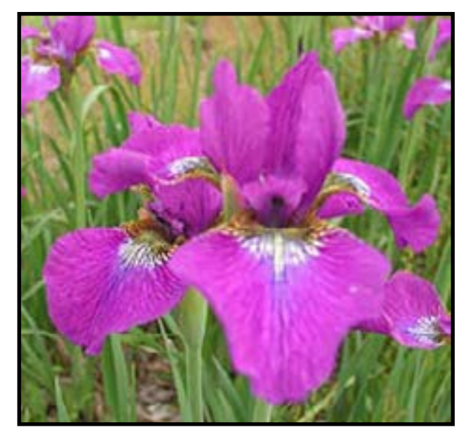
EWEN (McEwen, C.) 32", E. to M., 5 ¼" (T) $12.00

Large, bright wine-red with styles slightly lighter. Wide flaring falls that are a dark winered contrasting with pale yellow and brown blaze. Excellent substance. H.M. Award.