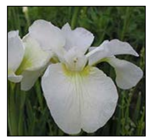
KING OF KINGS